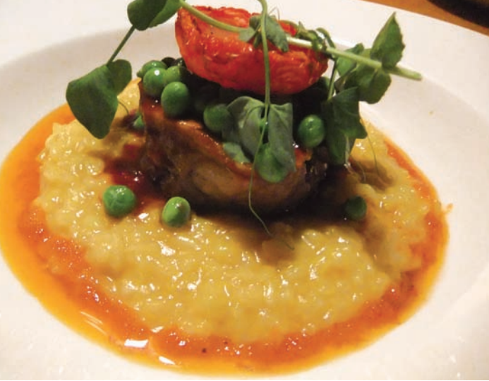
Try the tasty lamb “Milanese” with saffron parmesan risotto at Chives Bistro.