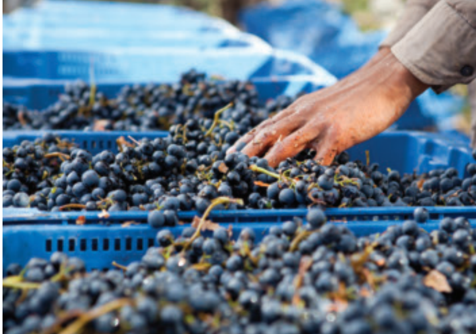
This winery sits at a dizzying 3,000 metres elevation.

Late arrival. Product may not be available at release time.