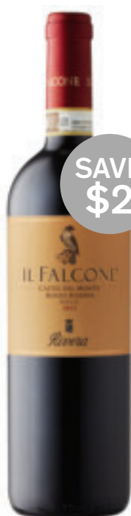
RIVERA IL FALCONE RISERVA CASTEL DEL MONTE DOCG, Puglia, Italy 177295 (XD) 750 mL REG. $24.95 NOW $22.95 Save $24 on a case of 12