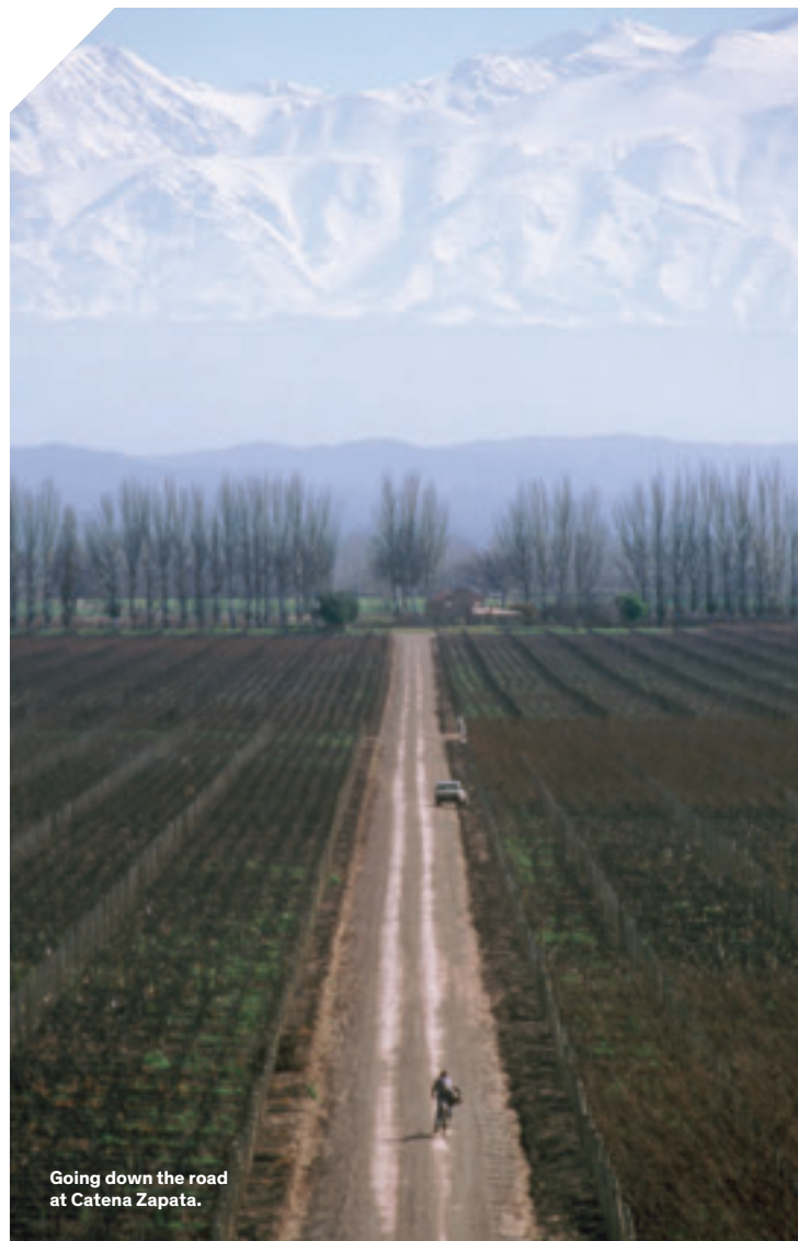
Going down the road at Catena Zapata.

FOR COMPLETE TASTING NOTES AND TO ORDER ONLINE, SEE PAGES 29 TO 30.