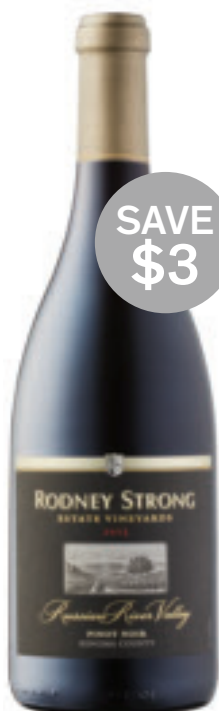
RODNEY STRONG ESTATE RUSSIAN RIVER VALLEY PINOT NOIR Russian River Valley, Sonoma County, California 954834 (XD) 750 mL REG. $29.95 NOW $26.95 Save $36 on a case of 12